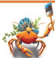
El Sacramento de la Sagrada Eucaristía