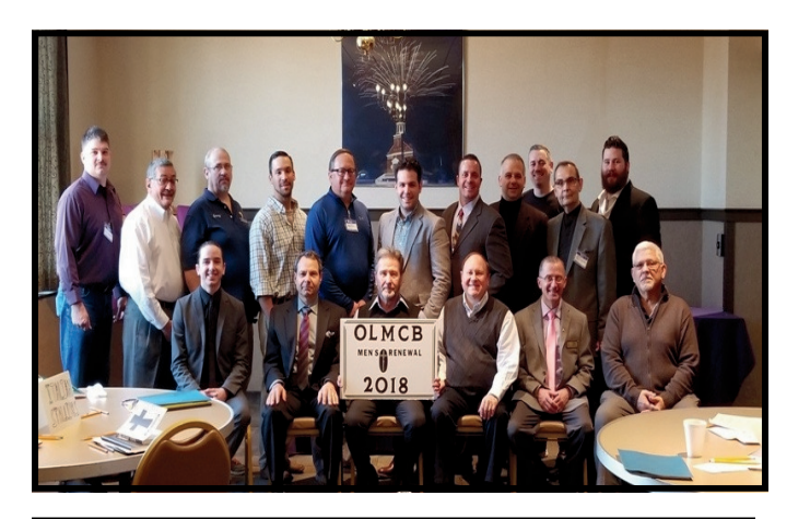
Our Lady of Mount Carmel Men's Retreat 2018

Mass & Novena at 9:00 a.m. 5:30 p.m. Novena before the Blessed Sacrament.