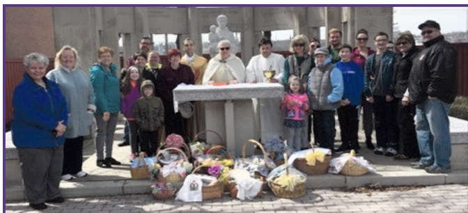
Blessing of the Easter Food 2018