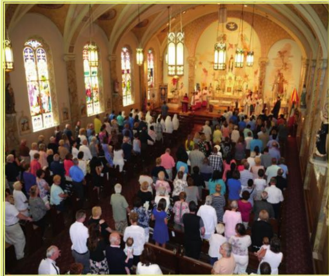
Sunday, July 15, 2018 Our Lady of Mt. Carmel Feast Day Mass