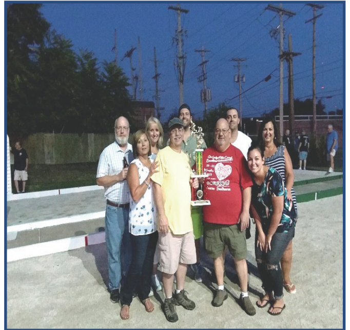
SECOND PLACE WINNERS!