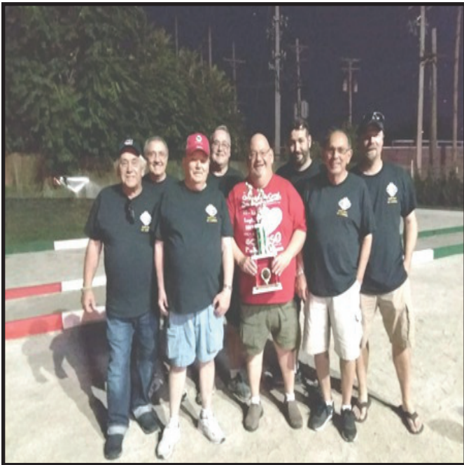
THIRD PLACE WINNERS!