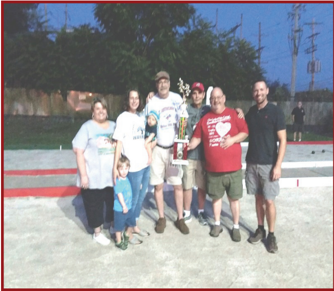
FIRST PLACE WINNERS!