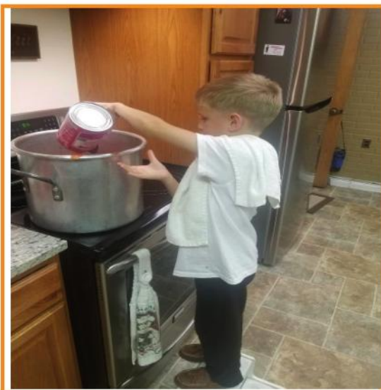
"One of the greatest secrets in life"