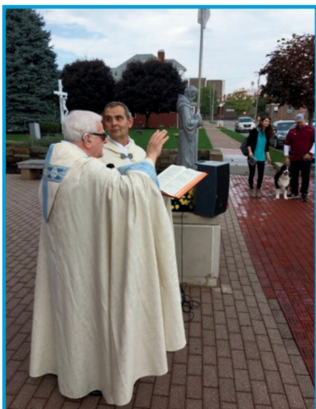
Blessing the Pets—Saturday, October 6, 2018

Sunday, October 7 ( 290 ) envelopes $10,070.00 St. Anthony Shrine/Novena $ 335.00