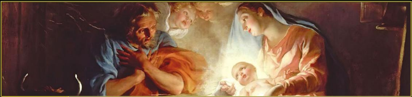
© Diocesan / The Athenaeum - Nativity (1730) - Noel-Nicolas Coypell III

...blessed is the fruit of your womb. Lk 1:42