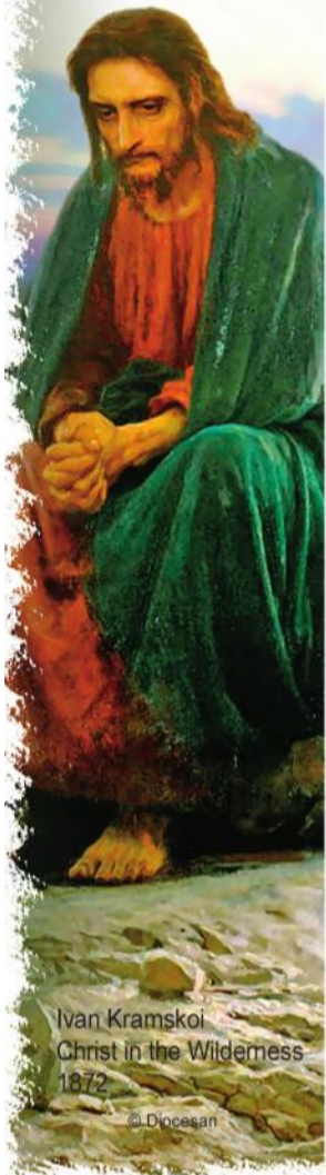
Ivan Kramskoi Christ in the Wilderness 1872