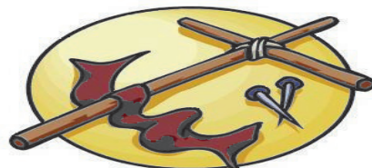
The Road to the Cross

REGISTRATION: Members of the parish must be formally registered. If you are not receiving Our Lady of Mount Carmel envelopes, this means you are not registered. Call the rectory at 330-743-4144, Monday-Friday, 9 a.m.—3 p.m. And we will send you a registration form. Families who have members of our church staying with them who are shut-ins or who are in nursing homes should include them as members of their household. For a change of address or telephone number, please call the rectory as soon as possible. Thank you.