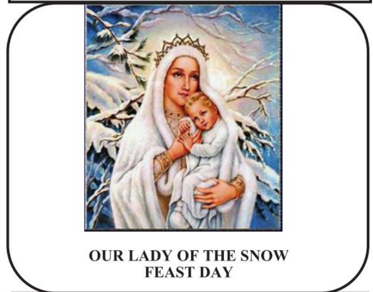
OUR LADY OF THE SNOW FEAST DAY

Live Music, Morra, Bocce Tournaments & Authentic Italian Food