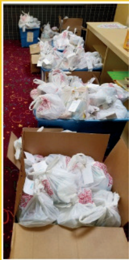
320 'Goody Bags' were filled for adults and children.

Thanks to everyone involved. It was a wonderful evening of assembling the 'Goody Bags' for St. Vincent DePaul at the Tree Lighting.