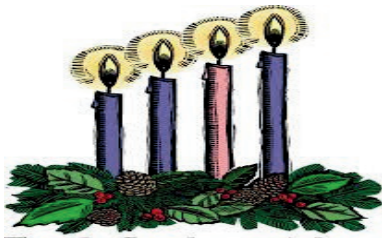
Fourth Sunday in Advent