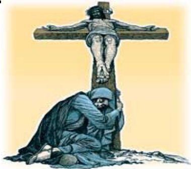
40 DAYS AT THE FOOT OF THE CROSS

The Msgr. John DeMarinis Hall is open for the events of our dear members of St. Anthony Church. Call the rectory to check the master calendar for making the reservation. The modest rental for the use of the hall will benefit the church. You will make arrangements with the church for clean up and security.