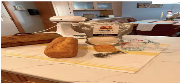
Homemade Tuscan Bread made by the Basilica

In today's New Testament reading, St. Paul urges us to offer our "bodies as a living sacrifice." While not necessarily calling us to give up our physical bodies, he is calling us to share the gift of our lives in a way that is pleasing to God. We recognize that our lives are gifts from God, and in turn, we are called to share pieces of our lives with others through our gifts of time, talent, and treasure.