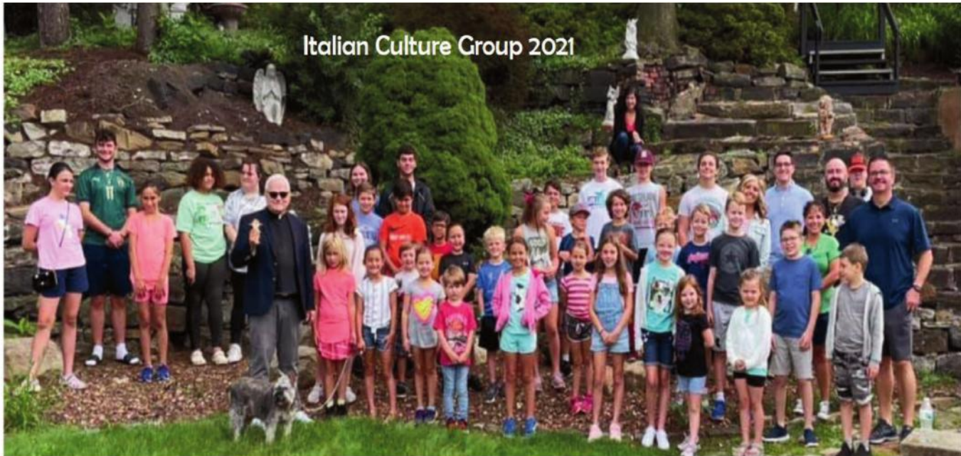
Italian Culture Group 2021