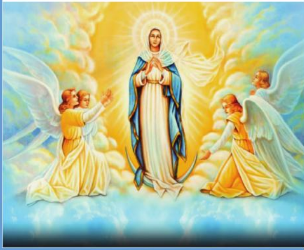
The Assumption of the Blessed Virgin Mary