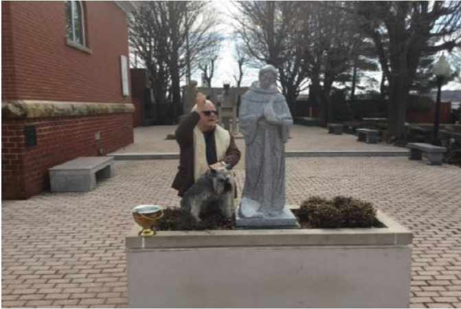
The granite statue of St. Francis is now placed and blessed. Back to normal. Thank God.