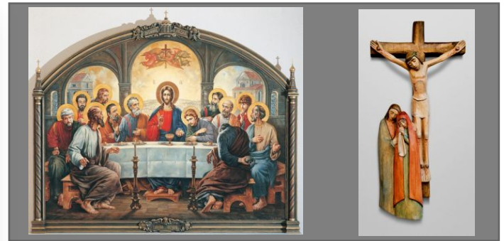
Lord, I will follow you ...

Jesus, with you, I can handle any fear. Amen