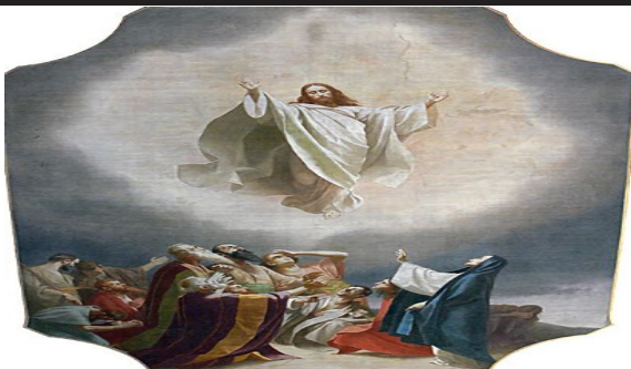
ASCENSION OF THE LORD