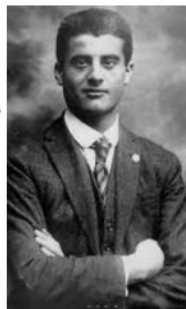
Blessed Pier Giorgio Frassati

"With all the strength of my soul I urge you young people to approach the Communion table as often as you can. Feed on this bread of angels whence you will draw all the energy you need to fight inner battles. Because true happiness, dear friends, does not consist in the pleasures of the world or in earthly things, but in peace of conscience, which we have only if we are pure in heart and mind."