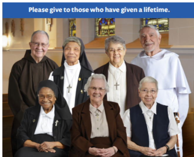
Visit retiredreligious.org/2022photos to meet the religious pictured.

Yes, I am willing to take the Vocation Cross home and pray for Vocations.