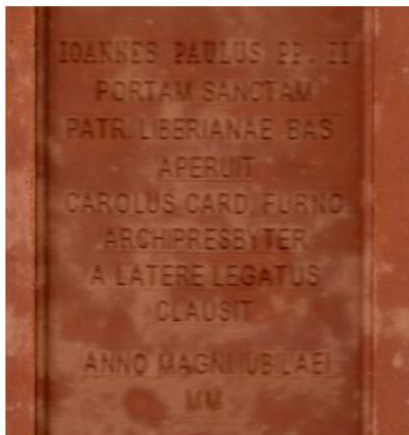
Inscription on the Papal Brick

This brick is to be a sign of the affiliation our Basilica hopes to obtain with St. Mary Major Basilica in Rome.