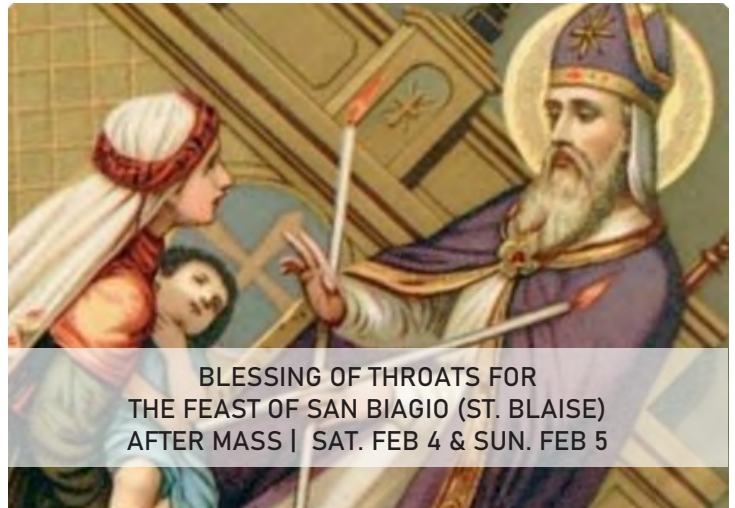
BLESSING OF THROATS FOR THE FEAST OF SAN BIAGIO (ST. BLAISE) AFTER MASS | SAT. FEB 4 & SUN. FEB 5

Through the intercession of St. Blaise, bishop and martyr, may God deliver you from every disease of the throat and from every other illness, in the name of the Father, and of the Son, and of the Holy Spirit. —Prayer from the Blessing of the Throats