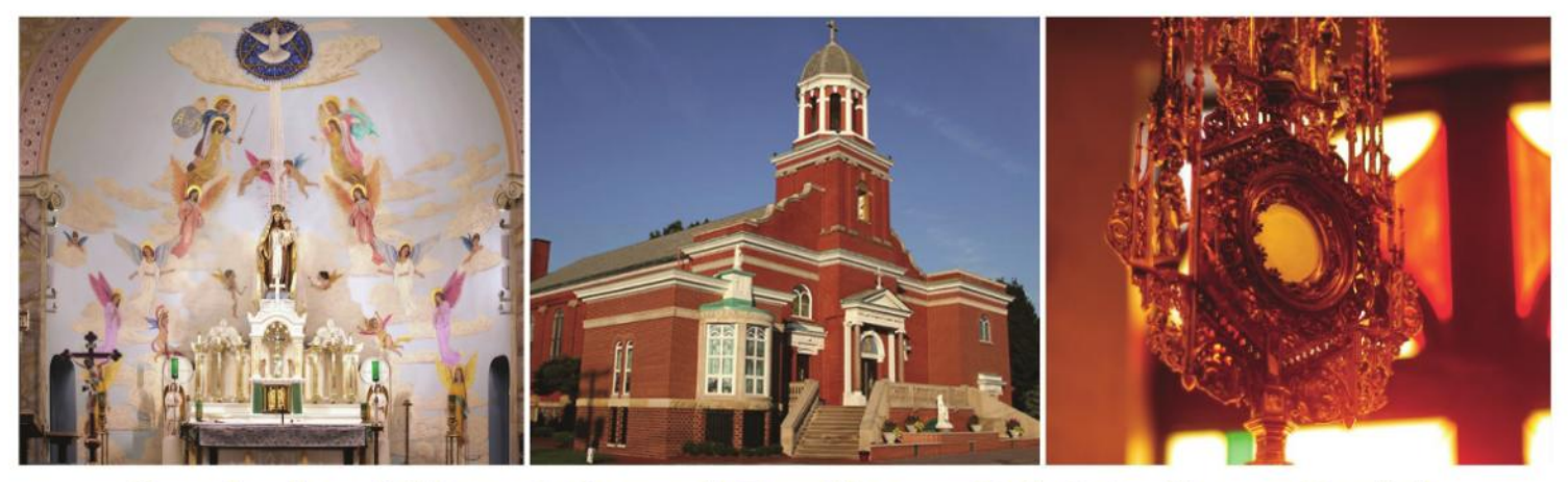
Our Lady of Mount Carmel Basilica – Saint Anthony Parish Youngstown, Ohio