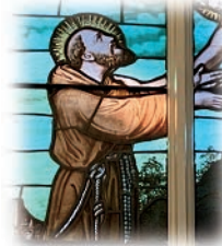
FRANCIS OF ASSISI