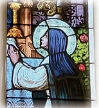
MARGARET MARY ALACOQUE