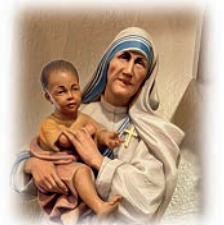
TERESA OF CALCUTTA