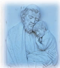
VINCENT DE PAUL