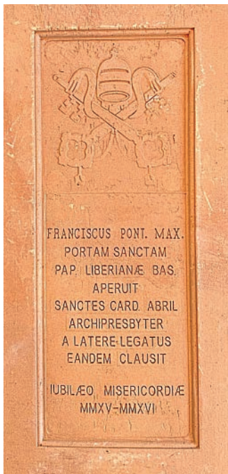
A close up of the brick received on October 19.

This brick is #1907 of 2000 bricks Pope Francis used in 2016 to close St. Mary Major Basilica’s Holy Doors following the Extraordinary Jubilee Year of Mercy. It was retrieved by Pope Francis on January 1, 2025, when the Holy Doors were opened for the current Jubilee Year of Hope.