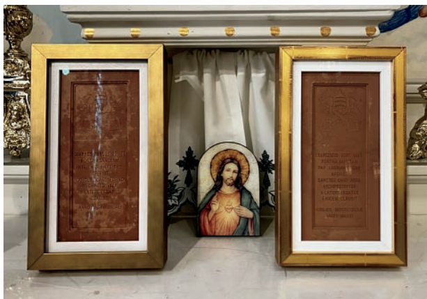
These two bricks serve as a visible reminder of the special spiritual bond shared between Our Lady of Mount Carmel and St. Mary Major.

Many are surprised to learn that Our Lady of Mount Carmel Basilica already had a brick from the Holy Door of St. Mary Major. On December 8, 2022, the Knights of Columbus gifted the Basilica with brick #407, a brick that was placed by Pope St. John Paul II to seal the Holy Doors following the Jubilee Year 2000. This brick was retrieved by Pope Francis in 2015 when he opened the Holy Doors for the Year of Mercy.