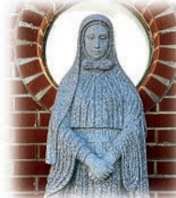
FRANCES XAVIER CABRINI