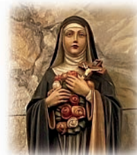
THERESE OF LISIEUX