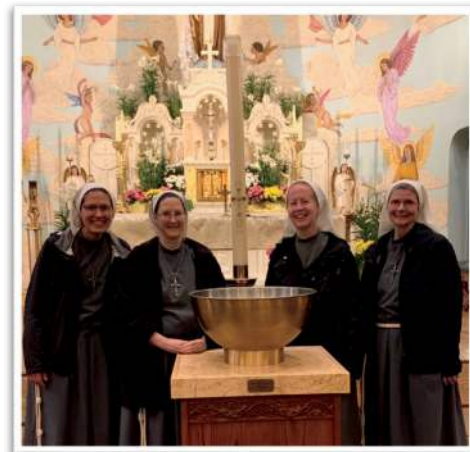
Four Franciscan Sisters took a pilgrimage to the Basilica on April 26, 2025.