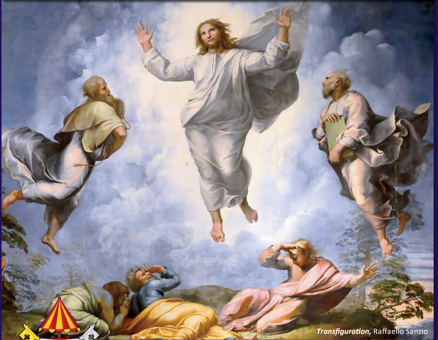
Transfiguration , Raffaello Sanzio